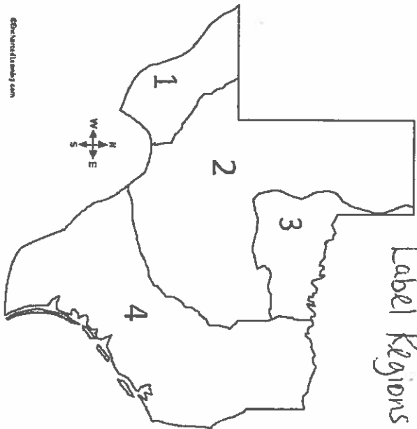
Label Regions of TX