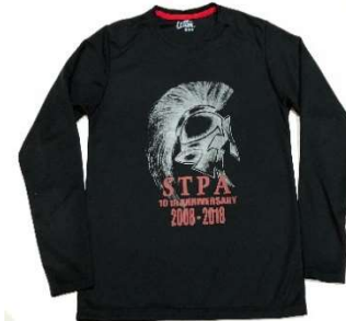
LONG SLEEVE DRY FIT SHIRT - $20 each