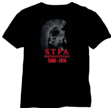
TSHIRT - $12 each