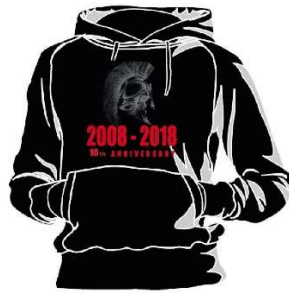
HOODIE - $25 each